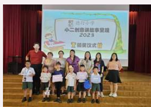
P2: Creative Storytelling