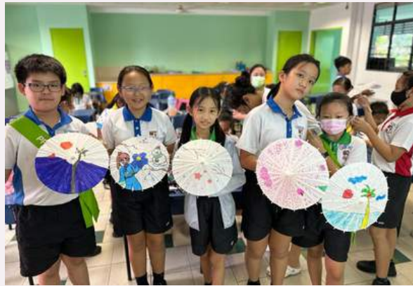
Chinese Umbrella Painting