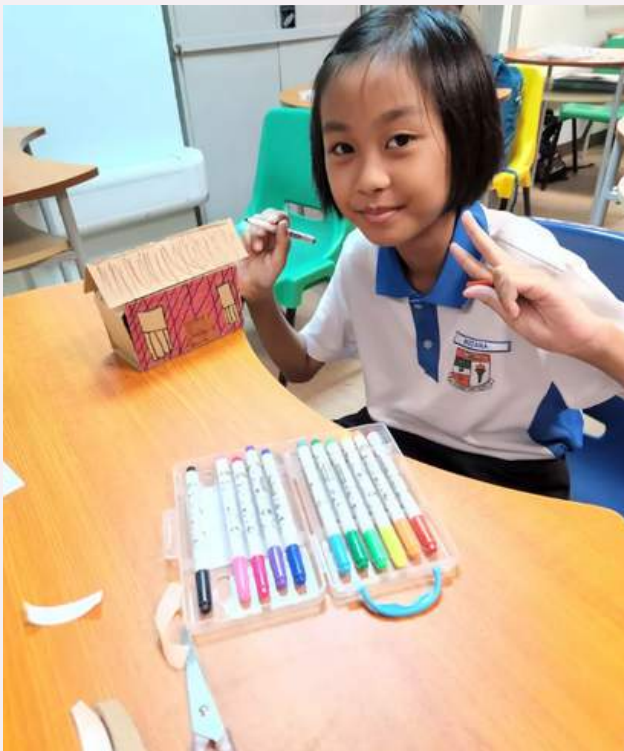
Malay 3D-Kampung Making