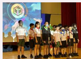
P4: Pop Singing