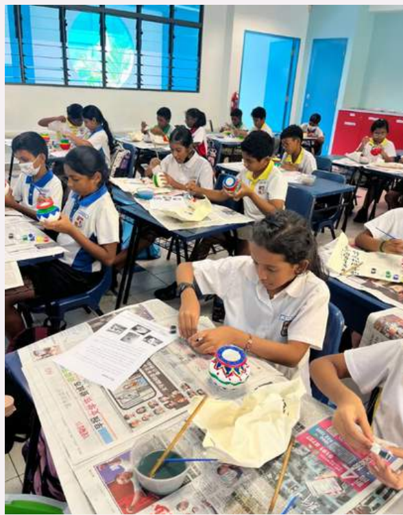
Indian Pot Painting