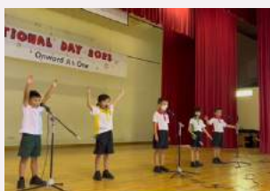
P1: Speech & Drama Performance

In line with Mother Tongue Language Fortnight, we organized various engaging activities for the pupils. Through these activities, pupils were able to learn and use Chinese Language actively, while showcasing their talents.