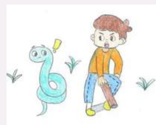
P5: Creative Idiom Drawing